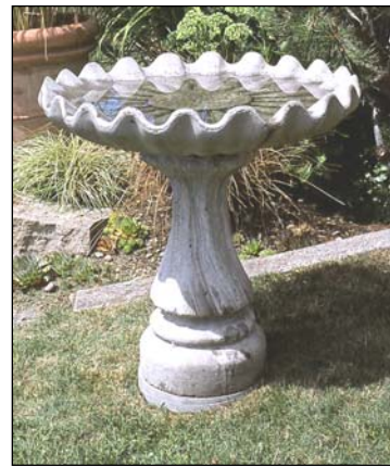
Great for bird baths and garden ornaments