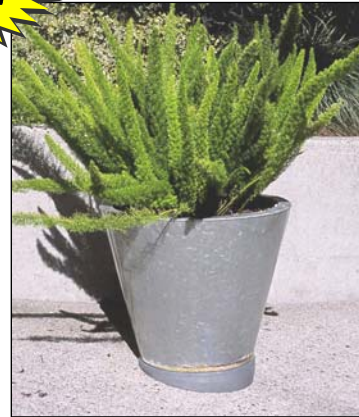
Works with all types of pots